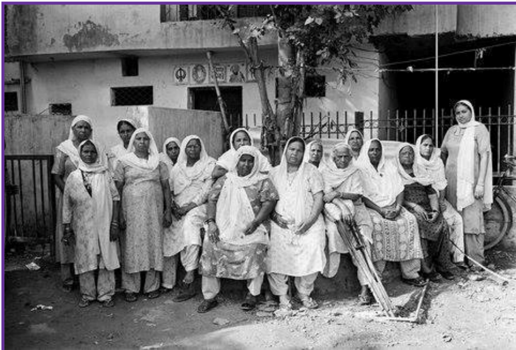
Widows of Tirlokpuri, in an estate also known as the Widows Colony

Some 300 years ago, Mata Sahib Kaur Jee and Mata Sundar Kaur Jee, the consorts of Sri Guru Gobind Singh Jee were ordered to leave Anandpur Sahib and go to Delhi for their own safety. They were accompanied by Shaheed Bhai Mani Singh Jee – as Delhi was seen as a safe haven. In modern India, in the same Delhi that Mata Sahib Kaur Jee and Mata Sundar Kaur Jee were cremated (at Bala Sahib Gurdwara) – Sikhs were openly burnt alive, raped and made refugees in country they saw as their own. After the assassination of Indira Gandhi – Sikhs were openly and systematically attacked across India in areas of control of the Congress-I party. Their homes and businesses were attacked and looted. Widows were the common survivors and female family members who were victims of gang rape. These brave women have endured the nightmares of this genocide for 30 years, with the chances of any justice in legal terms evaporating day by day. The criminals of these crimes roam freely and have in most cases been protected and promoted by the Indian state.